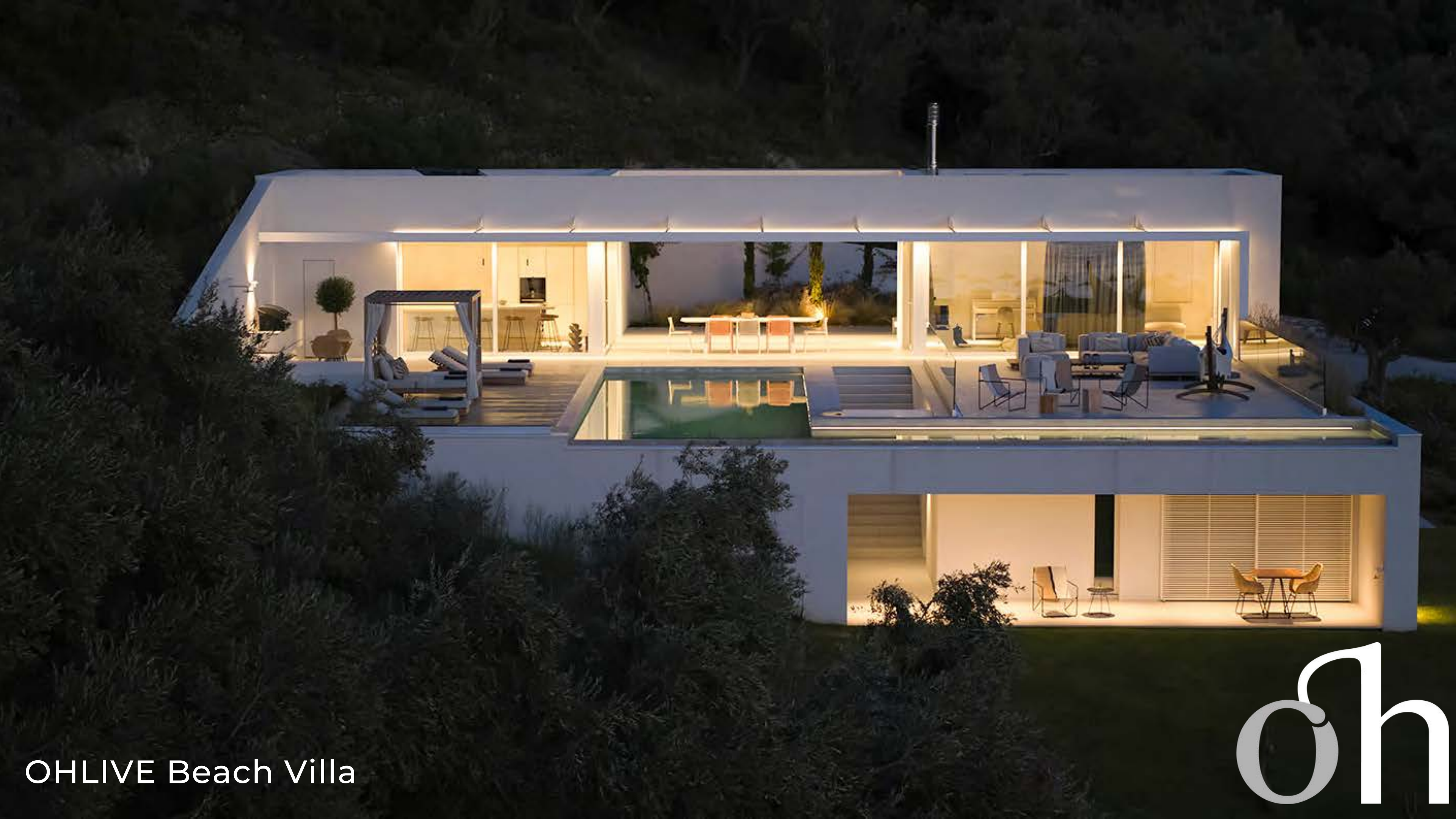
OHLIVE Beach Villa